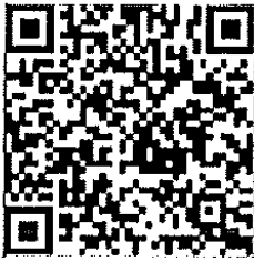
Apple QR code